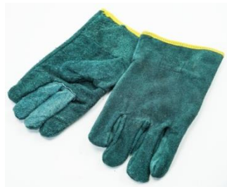
MN1002 -Welders gloves