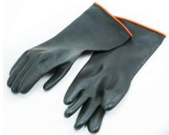
MN1007 -Rubber gloves- black & orange Insulating