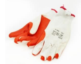
MN1003 -Crayfish glove