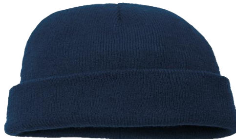
MN802 Knitted Beanie