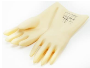
MN1008 -Rubber gloves- electrical