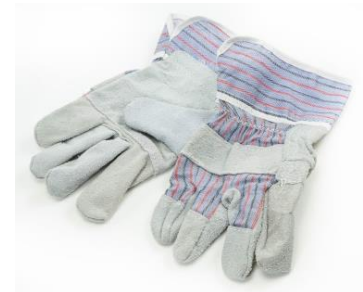
MN1006 -General protection-candy stripe