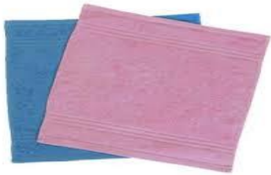
MN1110-Face cloth 100% cotton