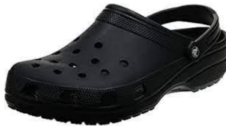
MN740 Crocks various colours

*Shoe prices available on request *Shape and type may differ from image provided.