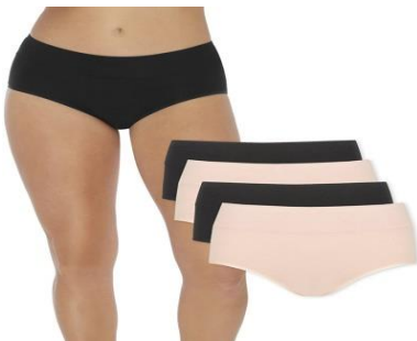
MN1107-Women's briefs 100% cotton