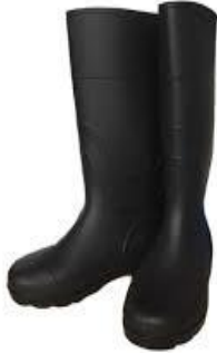
MN730 Gumboots (Black)