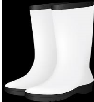
MN731 Gumboots (White)