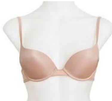
MN1105-Bra cotton padded underwire nylon/ polyester bra