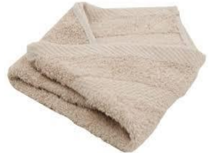
MN1112-Bath sheet 100% cotton