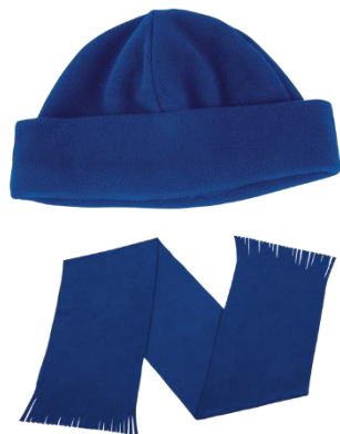
MN803 Glacier Scarf and Beanie Set