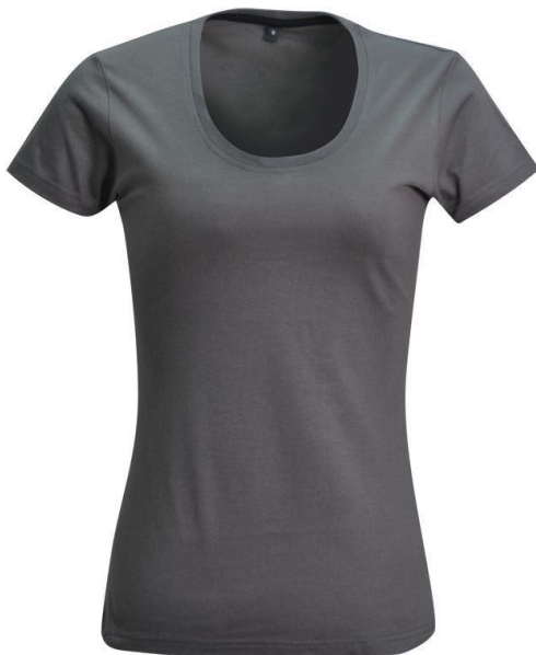
Jozi Basic T-Shirt

100% Cotton Cotton/ polyester blend 100% Polyester All available colours