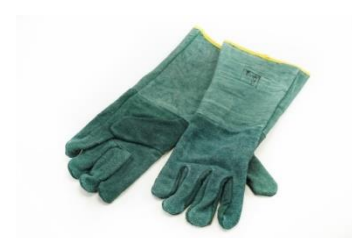
MN1009 -Welders gloves- long