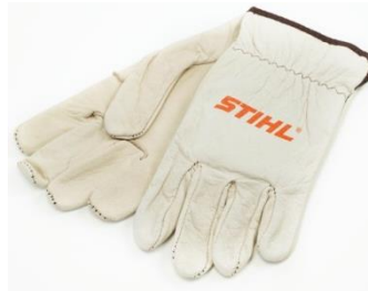
MN1005 -Woodwork Gloves-Saw