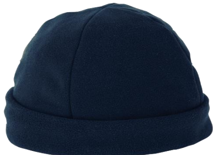
MN801 Polar Fleece Beanie