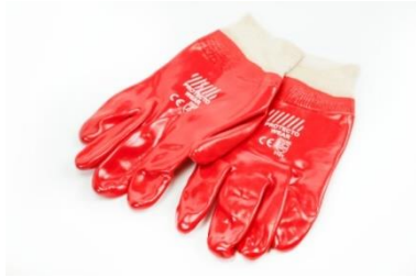
MN1001 -Pvc Sewage Gloves RED