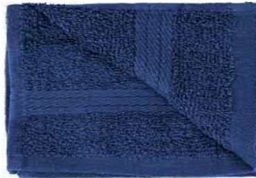
MN1111-Bath towel 100% cotton