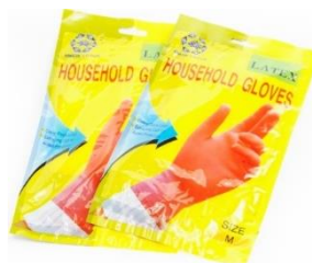
MN1011 -Household gloves