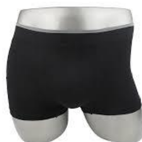
MN1108-Men's briefs 100% cotton