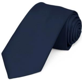
MN1113-Navy Blue Tie