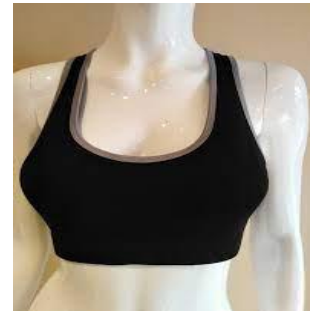
MN1106-Sports bra cotton Without pads/ underwire