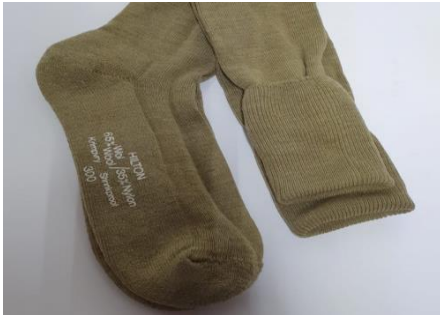
MN1101-Army socks 65%wool/35% Nylon