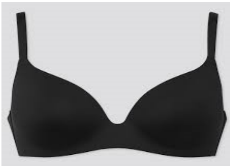
MN1104-Bra cotton padded without underwire