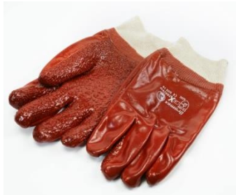
MN1004 -Freezer lined