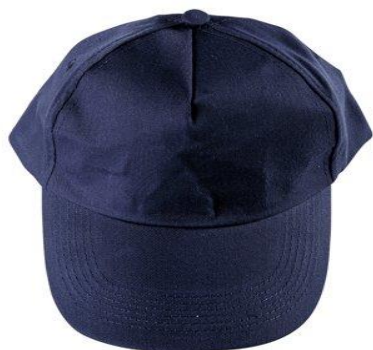
MN805 Versatex Cap