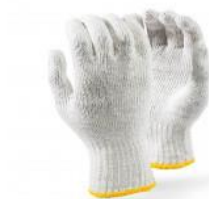
MN1010 -Cotton Seamless