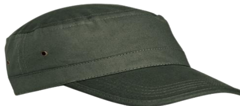
MN804 Castro Cap