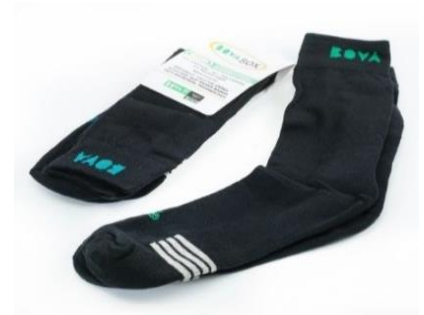
MN1103-Durable Socks 100% cotton