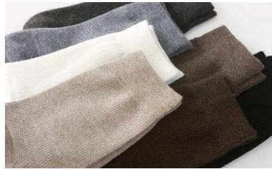
MN1102-Various Socks available on request: Sports, Crew, Ankle, Business dress