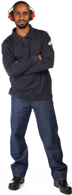
MN305-Golf shirt long sleeve Fire retardant

100% Cotton Cotton/ polyester blend 100% Polyester All available colours