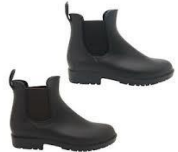
MN732 Ankle Gumboots